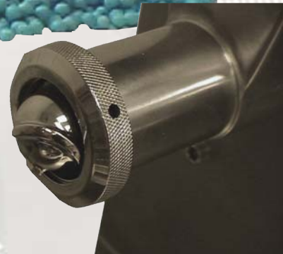
Standard Extruder Barrel